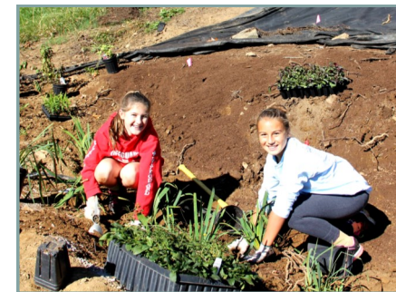
Enriching our community .

Radnor Educational Foundation 135 S. Wayne Avenue, Wayne, PA 19087 610-688-8100 ext. 6036